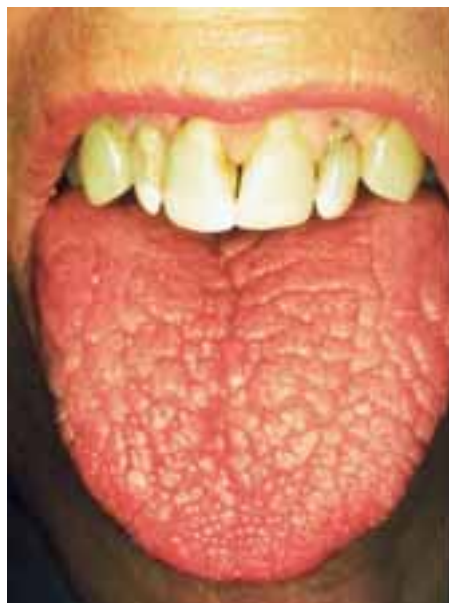
Lobulated tongue and root caries.

Complications include caries on roots and cusp tips, 22 a reddened, fissured, lobulated tongue, with atrophied papillae, and opportunistic infections, such as viral infections. Reduced salivary flow predisposes to overgrowth of Candida Albicans , causing candidiasis or angular cheilitis, particularly if dentures are worn. 23 Also, gingivitis, apthous ulcers, and cracked, bleeding, friable tissues. Mucositis occurs after radiation therapy or chemotherapy. Xerostomia accompanied by chronic salivary gland enlargement is associated with Sjögren’s syndrome, 24 sarcoidosis, HIV-associated salivary gland disease, chronic Hepatitis C infection, bulimia nervosa, 18 or lymphoma.