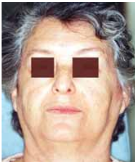
Chronic salivary gland enlargement.